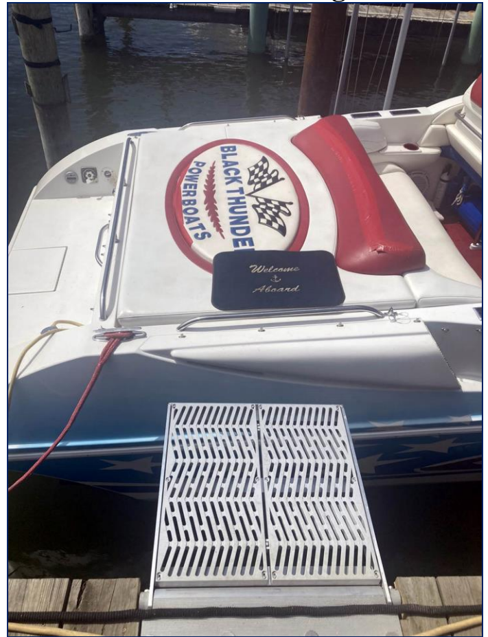
Installed at C-14

This is a 24" x 24" Tide Tamer boat access ramp that hinges and rotates away from the boat when the ramp is not in use and when you are docking. The Ramp cost is $750 and the installation cost will vary. These are a great option for slips with boatlifts. Talk to Scott to place an order or to get more information.