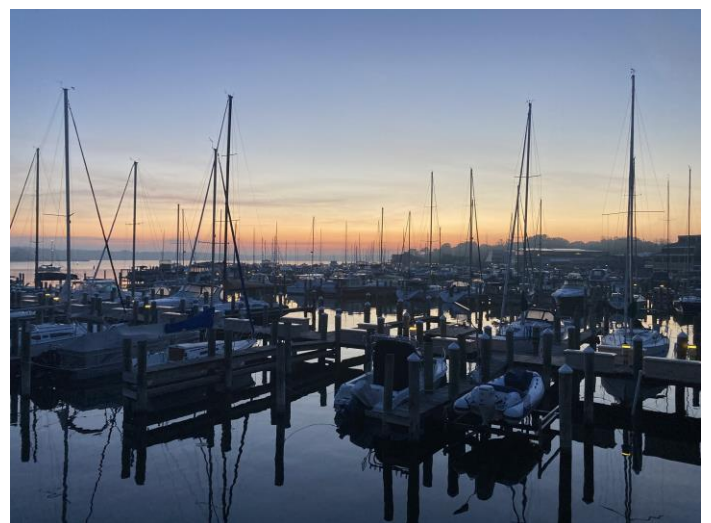
From my morning commute to work