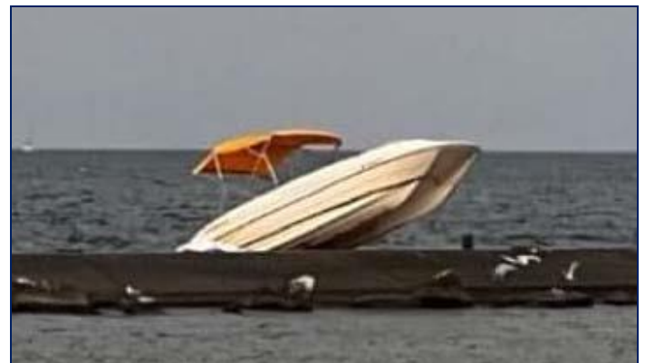
Holland South Pier – August, 2024

By following these safety tips , you can significantly lower your risks of injury.