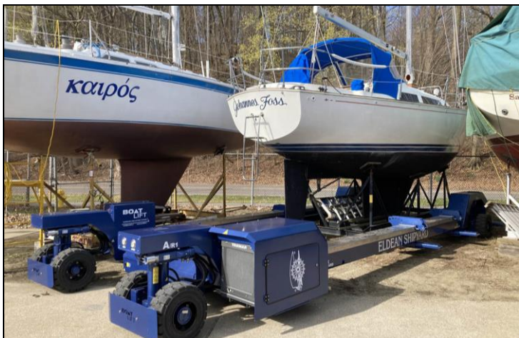
Our new 30 Ton, Boat Lift brand, Transporter

We are very excited for the arrival of our new, 30-ton Boat Lift , boat transporter! The new, remote-controlled machine, just arrived from Italy, & was assembled. We are getting oriented with it & begin bringing boats from our buildings to the haulout for this year's launch cycle.