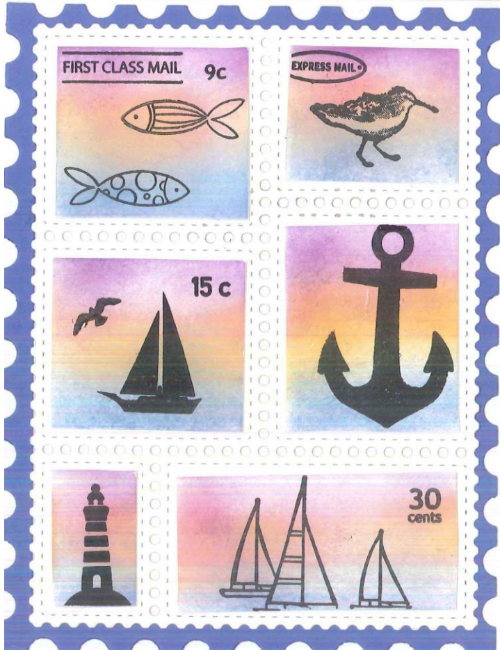
Fish + Sandpiper + Lighthouse + Sailing = Eldean Shipyard!