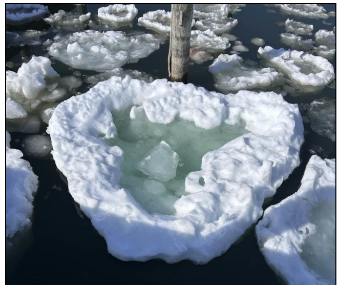
Interesting Ice Formations this winter!

I've had the pleasure of a dozen or more boat delivery trips along the Erie Canal. We generally work dawn-til-dusk, so I saw a lot in a short time, but I didn't get to explore much as we would only stop for the night. I would love to go back through the system on a pleasure cruise and take more time while in port to explore.