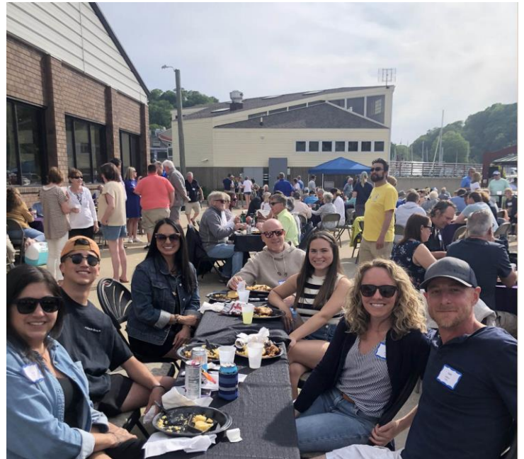
Eldean Shipyard 50 th Anniversary Party May 2023

C, D, E, R Docks & Buoys 6:30 pm, Saturday, July 26 Z, A & B Docks 6:30 pm, Saturday, August 9