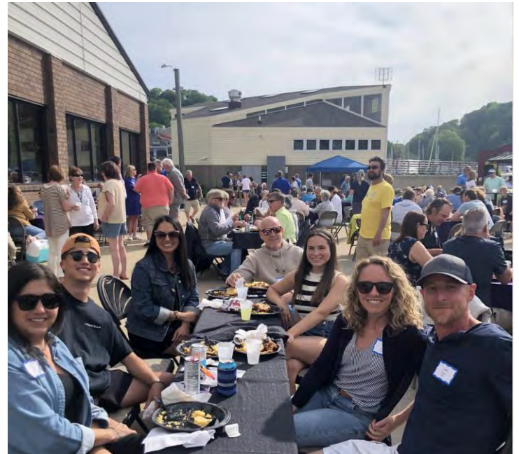
Eldean Shipyard 50 th Anniversary Party May 2023

C, D, E, R Docks & Buoys 6:30 pm, Saturday, August 10