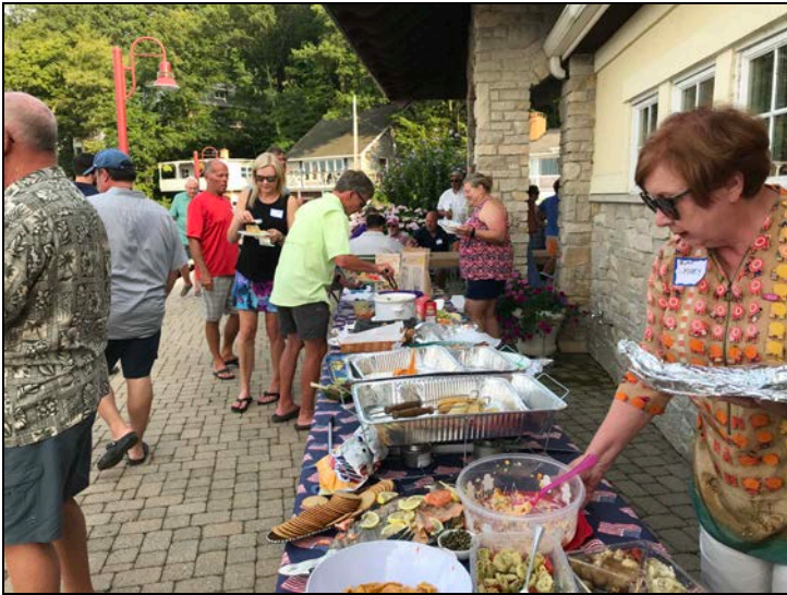
The A & Z Dock Party, 2018

Z & A Docks, 6:30 pm, Saturday August 12