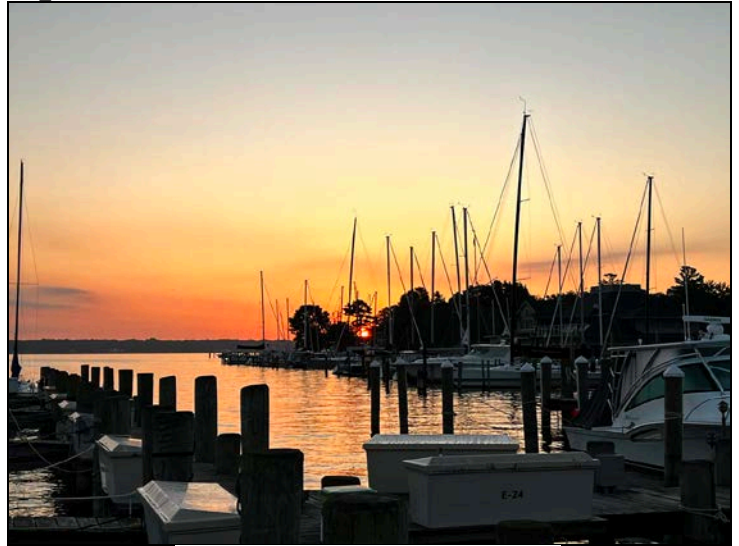
Sunrise from E-dock, looking east