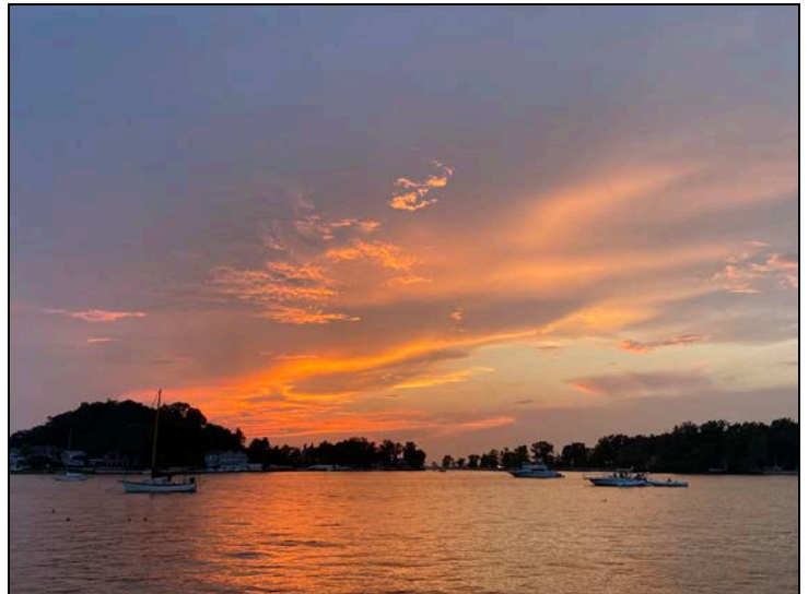
Sunset from E-dock, looking west