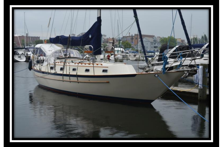
1999 Pacific Seacraft 37

This is exceptional example of a well maintained used boat. Over the years, much care has been provided by the owner & Eldean Shipyard.