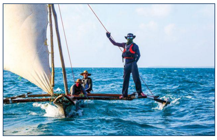
<u>Click here</u> for the complete article and additional photos. And, if anyone is looking for a crewmember for the Kraken Cup, give me a shout! Seriously.

According to Yachting World Magazine, there are a group of adventurists out there organizing "challenging journeys on very unsuitable vehicles." One of which is the Kraken Cup, which is marketed as "Possibly the most ridiculous ocean race in the world!" This race located in the tropical waters off East Africa, has you captaining a traditional, hollowed out mango tree with outriggers and a canvas sail over 180 miles and 7 days, stopping to camp on a beach at night.