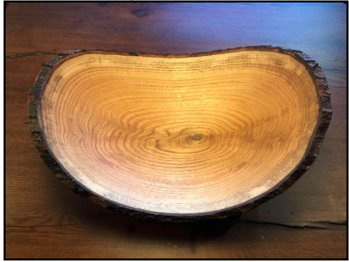
A NEW selection "Big Red" Oak Bowls are in the Shipstore!

We have had a 2<sup>nd</sup> run of bowls carved from Maple and Red Oak trees from our Marina Property. The new set of Red Oak bowls are stamped on the back with the Big Red Lighthouse. What a great gift – A Big Red themed bowl carved at the Holland Bowl Mill from a Big Red Oak Tree from Macatawa! Bowls range from $15 to $400. The big bowls are amazing and rare!