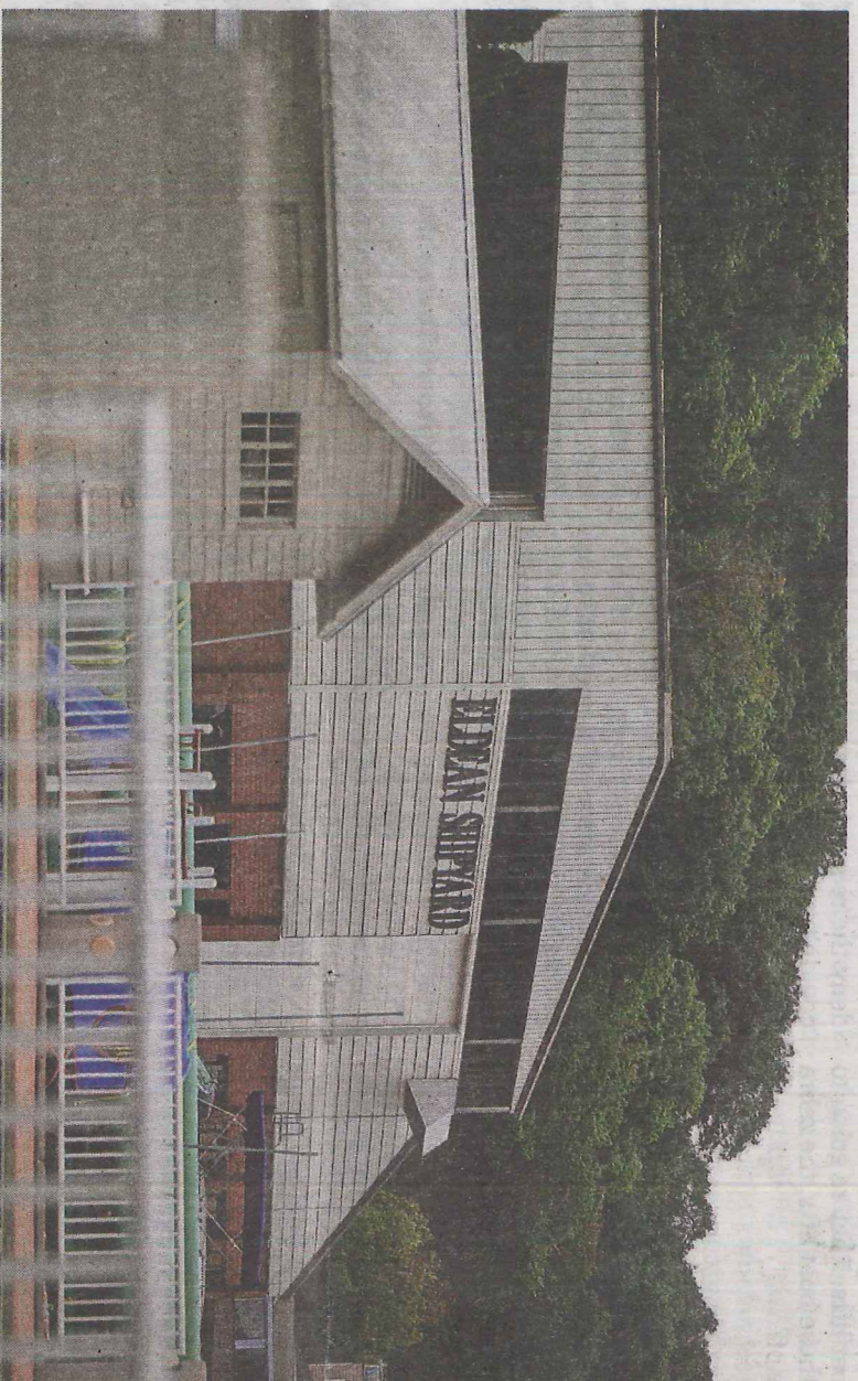
Rezoning the two parcels of property near Eldean Shipyards in Laketown Township has been put on hold.